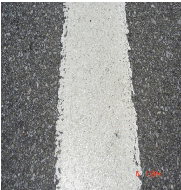
Original line after 22 months of service.