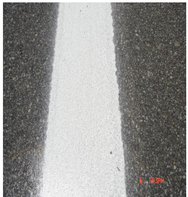
New line after partial removal